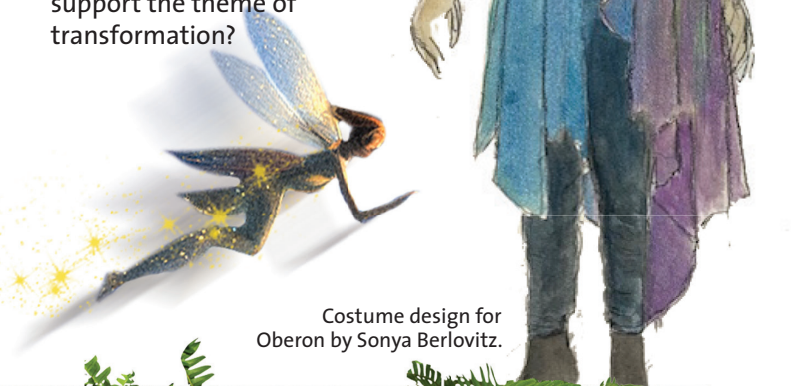
Costume design for Oberon by Sonya Berlovitz.