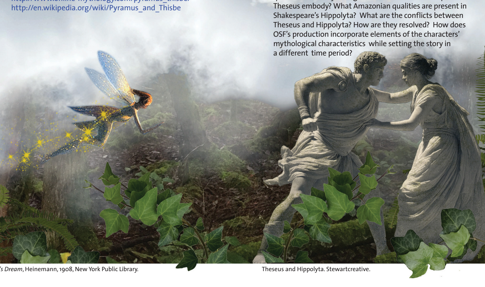
Theseus and Hippolyta.