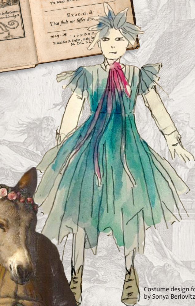
Costume design for Cobweb by Sonya Berlovitz.