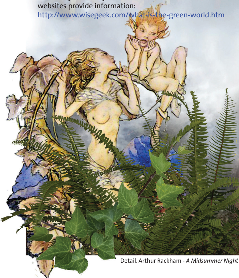
Detail. Arthur Rackham - A Midsummer Night's Dream , Heinemann, 1908, New York Public Library.

"The course of true love never did run smooth." -Lysander