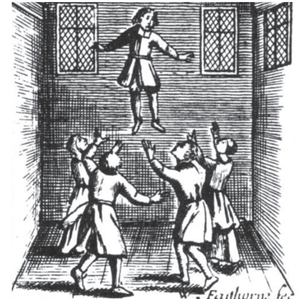
A child levitating due to the influence of witchcraft. From the book, Saducismus Triumphatus . William Faithorne (1616–1691).