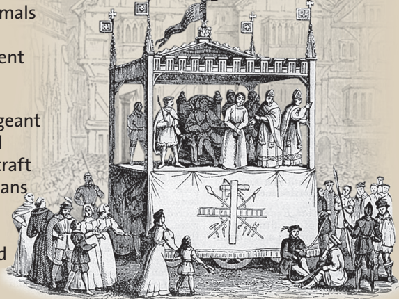
Chester Mystery Play pageant wagon - Wikimedia Commons.

most elaborate wagon. The Rude Mechanicals in A Midsummer Night's Dream are carrying on this proud tradition of creating community theatre.