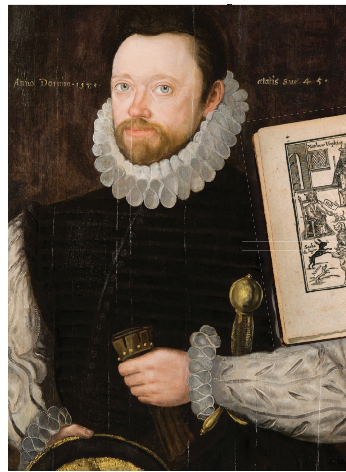
Reginald Scot (1537–99)

Shakespeare was just over 30 years old and coming into his greatness as a playwright when he wrote A Midsummer Night's Dream . Within the space of a year, he would also write his first great tragedy, Romeo and Juliet , and his first great history, Richard II . Shakespeare was also probably writing his 154-poem sonnet cycle at about the same time. Verse and verse structures were very much at the forefront of Shakespeare's mind during this period. A Midsummer Night's Dream contains more verse than any other comedy of Shakespeare's, just as Romeo and Juliet has the most of any tragedy, and Richard II is written entirely in verse.