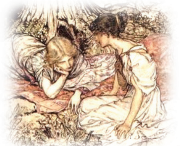
Hermia and Helena. Illustration by Arthur Rackham (1867–1939).