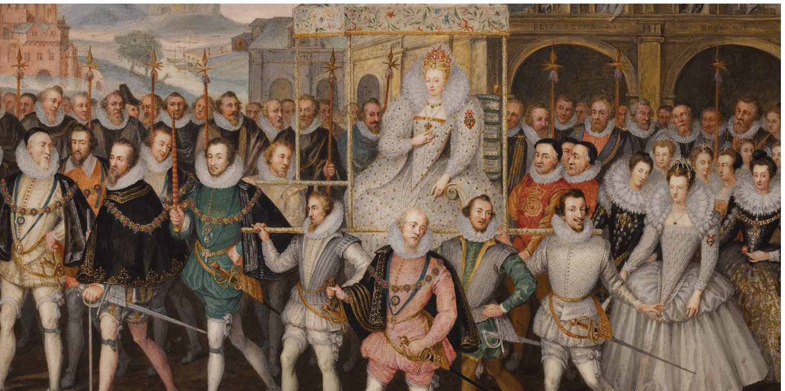
Queen Elizabeth I preceded by the Knights of the Garter, c. 1601.