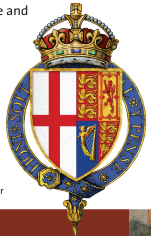
Arms of the Most Noble Order of the Garter