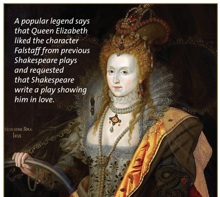
The Rainbow Portrait of Queen Elizabeth I. Public domain.

A popular legend says that Queen Elizabeth liked the character Falstaff from previous Shakespeare plays and requested that Shakespeare write a play showing him in love.