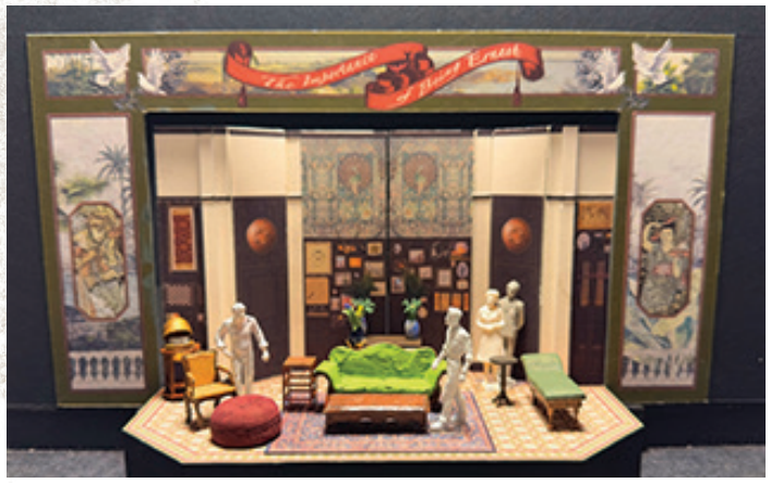
Act I Model Photo. Designed by Se Hyun Oh.