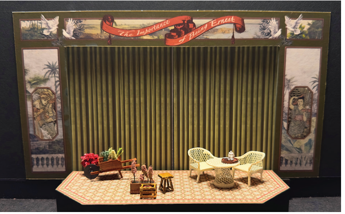
Intermission Model Photo. Designed by Se Hyun Oh.

https://victorian-era.org/victorian-era-courtshiprules-and-marriage.html