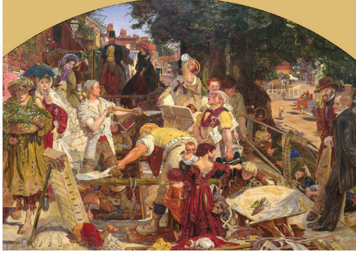
Victorian Era painting by Ford Madox Brown, 1865

goal of one's life, from dressing and decorating one's home to artistic pursuits like writing, painting, and sculpting. These artists were pushing against factory produced furnishings, clothing, and styles influenced by industrialism. Rather than highlighting the external energy and productivity of classically Victorian works, aesthetics were drawn toward the internal drama of a subject. Ironically, the art produced by this movement in reaction to the harsh reality of post-Industrial Revolution Britain, was most often purchased by wealthy industrialists.