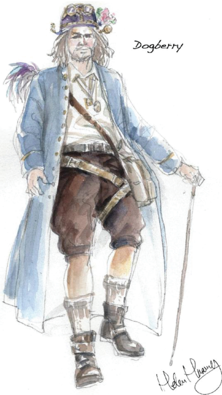
2023 costume designs for Dogberry in Much Ado About Nothing by Helen Huang.

Learn more about Shakespeare’s life and times at the following websites: http://internetshakespeare.uvic.ca/Library/SLT/index.html http://www.folger.edu/template.cfm?cid=865&C-FID=6230886&CFTOKEN=25420173 http://www.shakespeare.org.uk/explore-shakespeare.html http://shakespeare.palomar.edu/life.htm http://www.bardweb.net/man.html