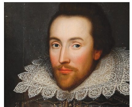
William Shakespeare, Cobbe portrait