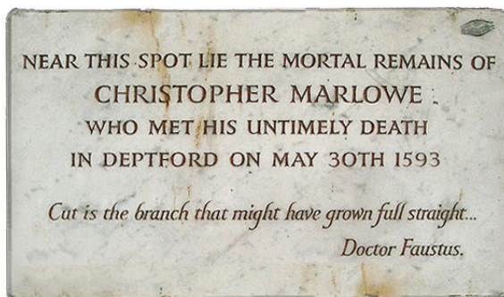
Memorial to Christopher Marlowe on the Eastern Wall around St. Nicholas Church, Deptford Green

While there is little concrete information regarding the two, we do have clues of the respect (or contempt, perhaps) Shakespeare held for Marlowe. In As You Like It , Phebe's reference to "Dead Shepherd" is a nod to Marlowe's poem, Hero and Leander . Touchstone makes a second reference with "...strikes a man more dead than a great reckoning in a little room.", alluding to the circumstances of Marlowe's death.