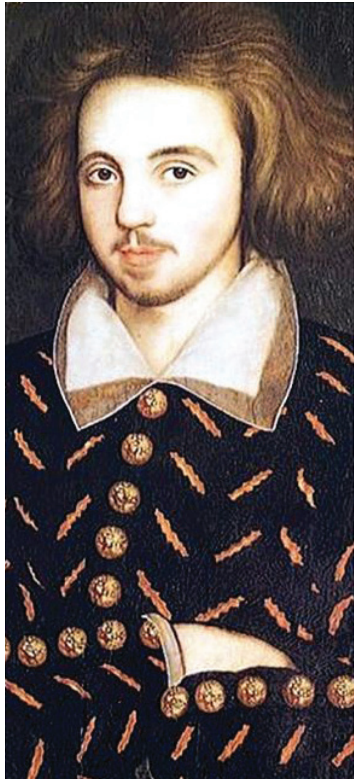
Portrait of Christopher Marlowe.

Members of Oregon Shakespeare Festival Education and Engagement created the 2022 Study Guide for Born With Teeth . These suggestions were designed for students and teachers but may be enjoyed by audiences of all ages. They may be used without restriction for educational purposes. The Oregon Shakespeare Festival is not responsible for the content of any website listed above.