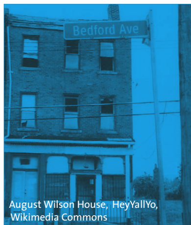
August Wilson House