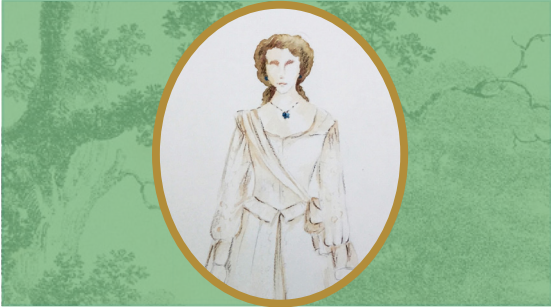
Costume rendering of Anne Page by Ulises Alcalá.