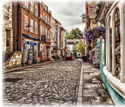
Town of Windsor