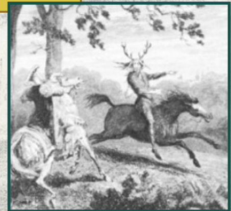
Herne the Hunter, print by George Cruikshank, 1843.

Toward the end of the play, you will hear reference to the local Windsor legend of Herne the Hunter, a ghost who haunts the forest near the oak tree from which he was found hanging. While there are several versions of this story, in all of them Herne was found dead with deer horns on his head.