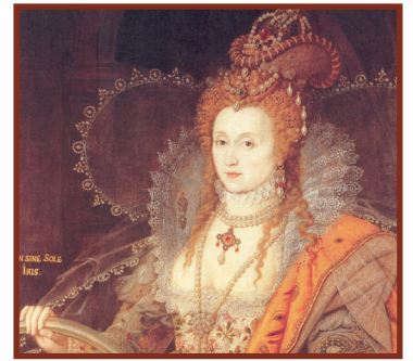
The Rainbow Portrait of Queen Elizabeth I

A popular legend says that Queen Elizabeth liked the character Falstaff from previous Shakespeare plays and requested that Shakespeare write a play showing him in love.